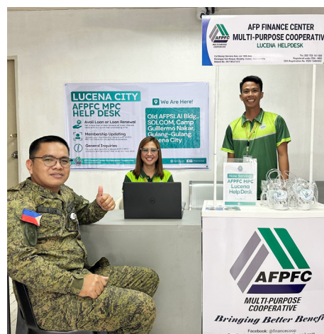
The AFPFC MPC Lucena Help Desk opened on January 28, 2025

To further establish its service presence throughout the country, AFPFC MPC is schedule to open more help desks within the year.