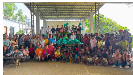
Aeta tribe members in San Clemente, Tarlac

For the tribe members in San Clemente, Tarlac, AFPFC MPC went to Sitio Dueg Proper, Sitio Maconray, Sitio Porquiz, and Sitio Maasin Proper. Together with the 3rd Mechanized Infantry Battalion, the Cooperative provided outreach aid for the upland tribe members.