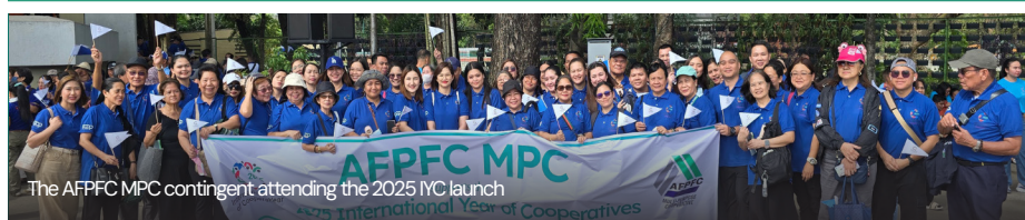
The AFPFC MPC contingent attending the 2025 IYC launch

Philippine cooperatives stand in solidarity with IYC 2025