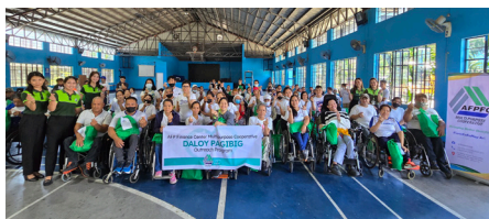
TWH stakeholders during the first Daloy Pagibig outreach program

Tahanang Walang Hagdanan (February 12, 2025)