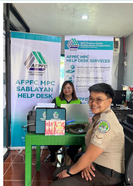
The Sablayan Help Desk, opened on February 20, 2025

Placed in strategic locations, the three new help desks serve as an alternate means for Kamay-Ari to transact with AFPFC MPC.