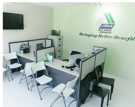
Inside the office space of the new Maguindanao SO Cont. P2