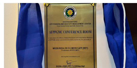
The recognition plaque outside the AFPPGMC Conference Room

AFPFC MPC remains committed in supporting the AFP PGMC in serving the greater AFP community.