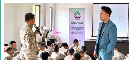
Trainees asking questions during the financial seminar

Newly-minted graduates of the Sablayan Prison and Penal Farm (SPPF) in Occidental Mindoro attended a financial literacy seminar held by the AFP Finance Center Multipurpose Cooperative (AFPFC MPC) this February 21, 2025.