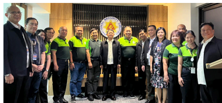
AFPFC MPC Members of the Board with the NSC leadership

The AFP Finance Center Multipurpose Cooperative (AFPFC MPC) paid a courtesy visit to the National Security Council (NSC) at their headquarters in Quezon City on February 18, 2025.