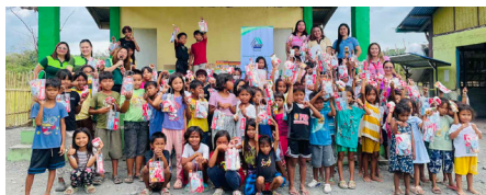
Mangyan students of Libagon Minority School during the distribution

With its commitment to community service for Indigenous People and vulnerable sectors, the AFP Finance Center Multipurpose Cooperative (AFPFC MPC) distributed 125 dental hygiene kits to the IP students of Libagon Minority School in Sablayan, Occidental Mindoro, last February 20, 2025.