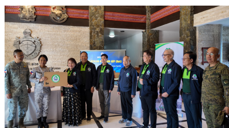
AFPFC MPC Directors with the PMA Office of the Superintendent

Cooperative (AFPFC MPC) paid a courtesy visit to the Office of the Superintendent at the Philippine Military Academy (PMA) in Baguio City last February 6, 2025.