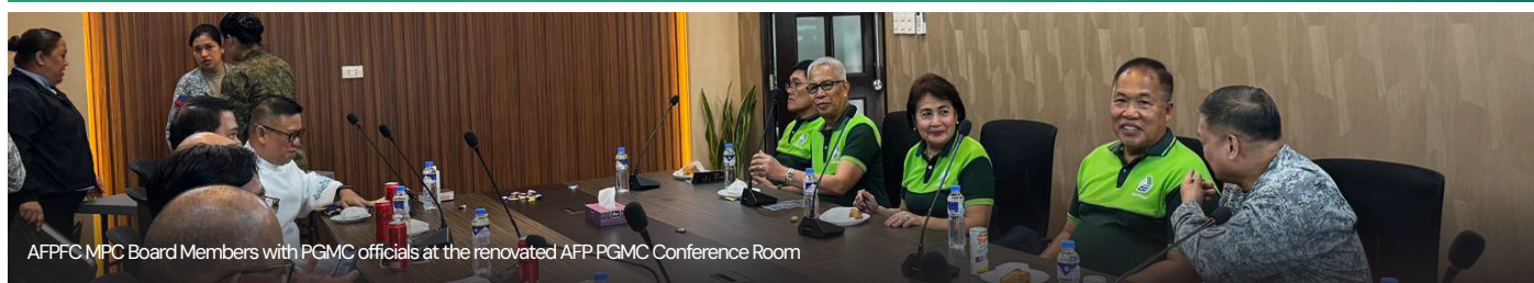
AFPFC MPC Board Members with PGMC officials at the renovated AFP PGMC Conference Room

AFPFC MPC also took part in the last International Year of Cooperatives previously held in 2012.