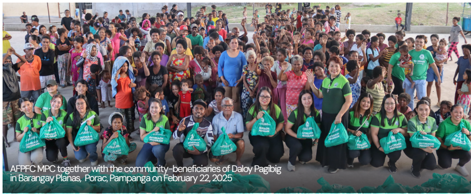
AFPFC MPC together with the community-beneficiaries of Daloy Pagibig in Barangay Planas, Porac, Pampanga on February 22, 2025

Outreach program for underserved sectors launched