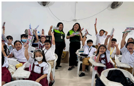
AFCES students with their donated dental kits

The AFP Finance Center Multipurpose Cooperative (AFPFC MPC) distributed 399 dental kits to students at Air Force City Elementary School (AFCES) in Clark, Pampanga last February 5, 2025.