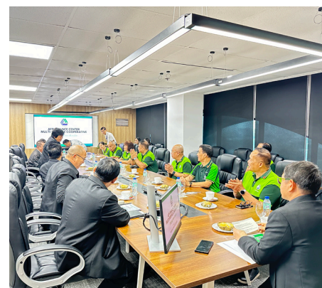
AFPFC MPC presenting its benefits to the top NSC officials during the visit

AFPFC MPC is thankful for the chance to meet with the NSC and looks forward to similarly fruitful engagements with the Council in the near future.