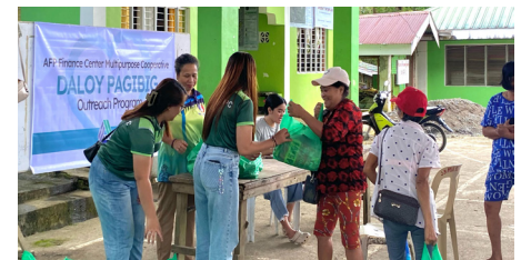
AFPFC MPC distributing grocery aid in Jamindan, Capiz

AFPFC MPC also extended aid to the Tumandok IP tribe members in Jamindan, Capiz on March 1, 2025.