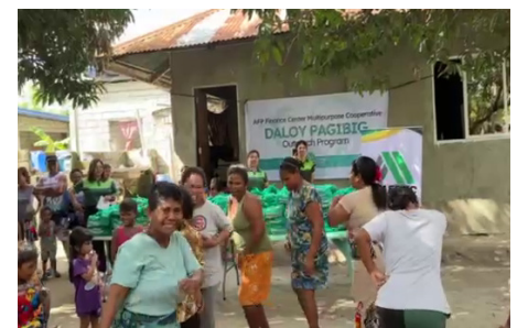
Antsi members performing their indigenous dance as a gesture of thanks

The Antsi IP tribe members of Barangay Cutcut in Capas, Tarlac likewise received gift packs as outreach aid from AFPFC MPC through the Daloy Pagibig Outreach Program on March 7, 2025.