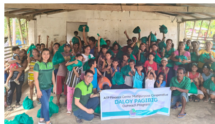
The Aeta tribe community in Rosario, Batangas

AFPFC MPC then extended support to the Aeta tribal community members residing in Barangay Putingkahoy, Rosario, Batangas on February 15, 2025. The donated gift packages were received by IP families in communities native to the area.