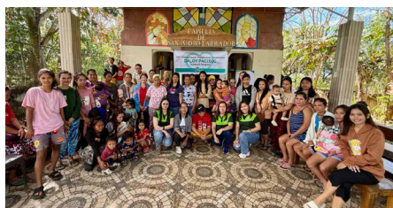
Dumagat and Remontado IP tribe members

This was followed by an initiative to reach the Dumagat and Remontado Indigenous Peoples (IP) groups in Tanay, Rizal on February 15, 2025.