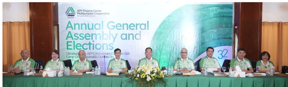
The Board of Directors present during the 2024 ARGAMEO

Through the successful completion of the ARGAMEO, AFPFC MPC reaffirms its dedication to another year of future-facing growth, success, and improved member benefits. AFPFC MPC looks forward to building on its achievements to bring greater mutual value to its members and communities.