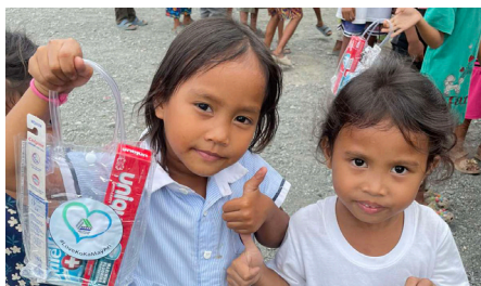
Two Mangyan students holding their oral kits

Staying in a remote area, the students are mainly composed of Mangyan tribe children who are part of the IP group in the region. The donated oral kits aim to support the children's oral health.