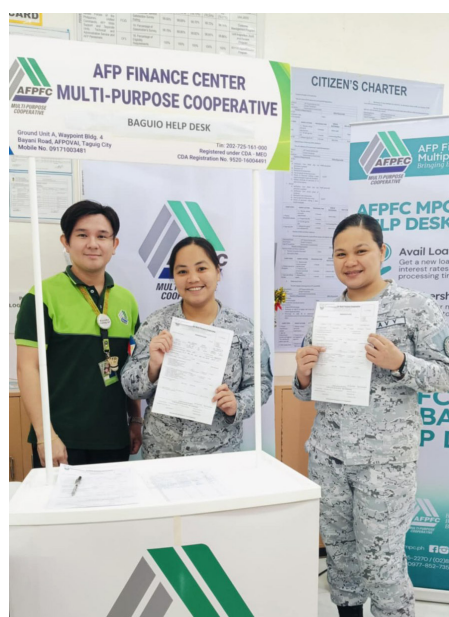
The Baguio Help Desk at PMA, opened on February 11, 2025

First to open was the Lucena Help Desk, addressed at the Old AFPSLAI Building at Southern Luzon Command, Camp Guillermo Nakar, Gulang-Gulang Lucena City.