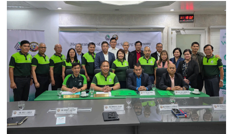
AFPFC MPC leadership with OTS officials during the MOA signing ceremony

The AFPFC MPC is delighted to have the OTS as its new Kamay-Ari and looks forward to a fruitful partnership positively impacting more members now within its reach.