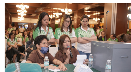
Poll-watchers calling the casted ballots

During the ARGAMEO, members voted on the open positions for the Members of the Board of Directors and the slots available for the Election Committee and the Audit and Inventory Committee.