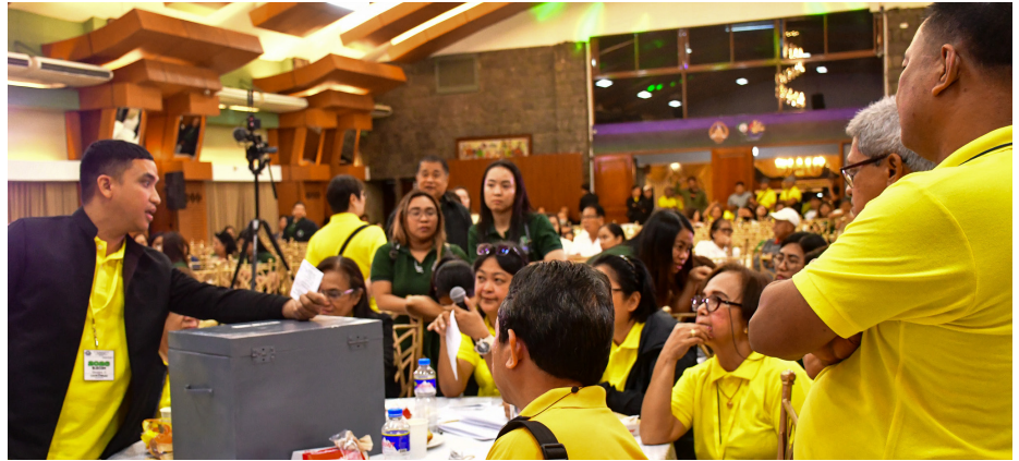
Election Committee members and staff officiating the counting of ballots.