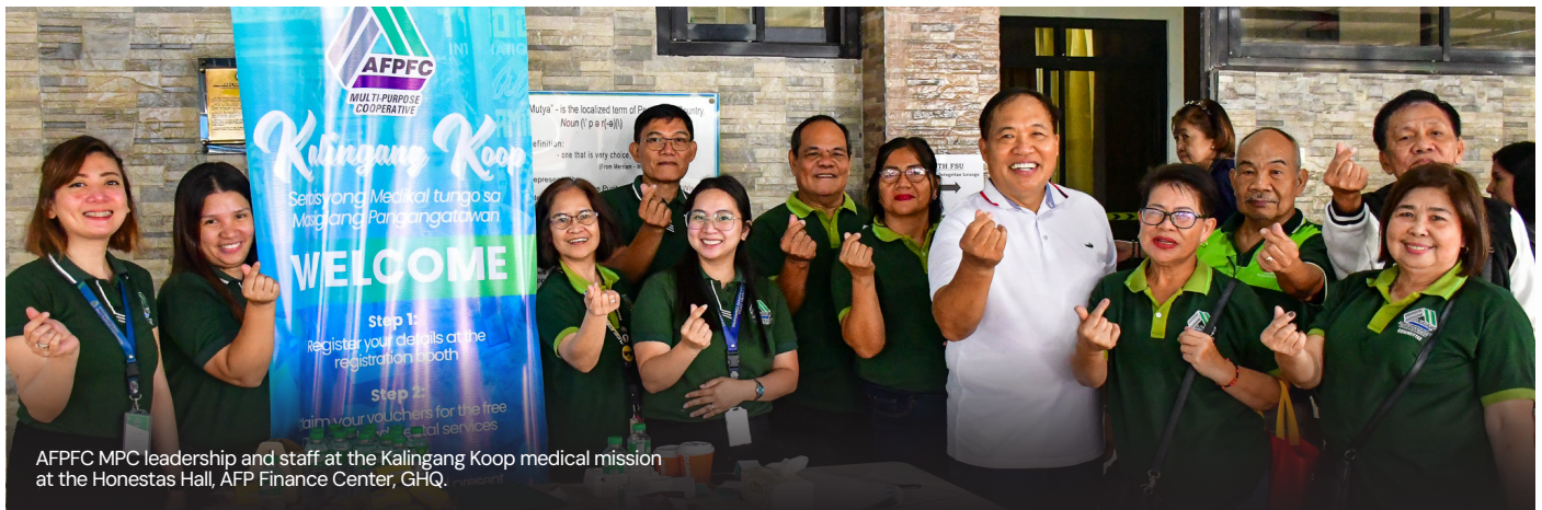
AFPFC MPC leadership and staff at the Kalingang Koop medical mission at the Honestas Hall, AFP Finance Center, GHQ.

Partner communities benefit from community development initiatives