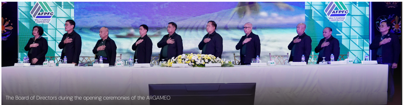
The Board of Directors during the opening ceremonies of the ARGAMEO

With the successful completion of the ARGAMEO 2026, the AFPFC MPC reaffirms its unwavering dedication to climbing onward and upward to greater heights and continuously bringing better benefits to all Kamay-Ari.