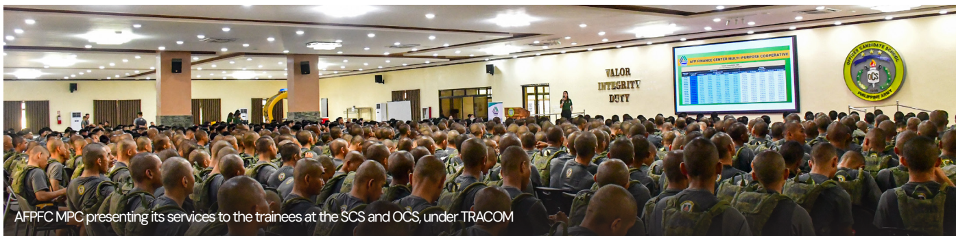
AFPFC MPC presenting its services to the trainees at the SCS and OCS, under TRACOM

Brings AFPFC MPC closer to units, localities, and stakeholders