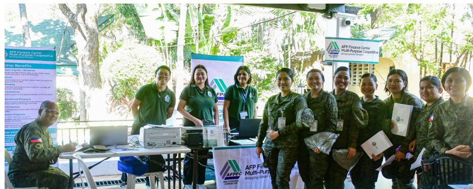
During the Women's Month Stakeholders Caravan at Fort Bonifacio, Taguig.

With a lasting resolve to make its services more convenient and accessible to its members, AFPFC MPC is set to launch more initiatives to be where its Kamay-Ari are nationwide.