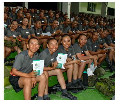
Attending trainees during the financial literacy seminars held at the OCS and SCS.

With these initiatives, AFPFC MPC continues its role as a financial partner for AFP personnel, empowering them to be at the center of their financial goals and futures.