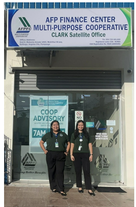
Contact the Clark office through 0917-125-8428

At the relocated Villamor and Clark Satellite Offices, Kamay-Ari can expect improved levels of service during their visits—with the offices featuring better amenities for enhanced member comfort.