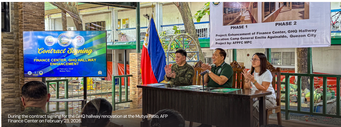
During the contract signing for the GHQ hallway renovation at the Mutya Patio, AFP Finance Center on February 23, 2026.

Equipment donations and facility improvement support capacity and welfare of stakeholders