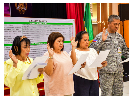
Election Committee and Audit and Inventory Committee officers during their oath-taking.

Along with the Board of Directors, a total of one and three committee officers were voted in for the Election Committee and Audit and Inventory Committee, respectively.