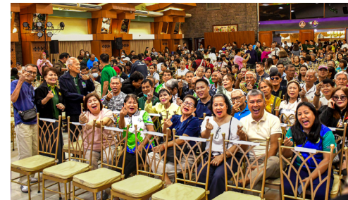
Kamay-Ari posing during the ARGAMEO