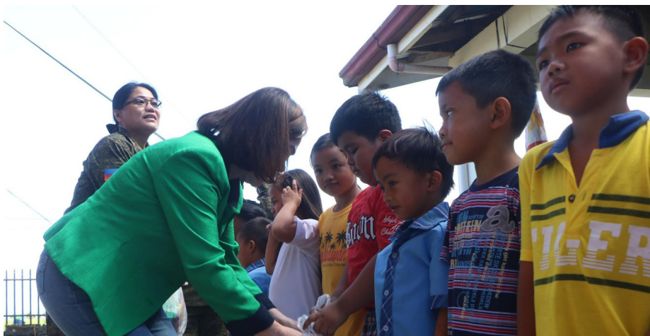
Children receiving hygiene kits and slippers during a Cooperative-led donation activity.

Following its history of continuous and responsive social development initiatives, AFPFC MPC, through Kalingang Koop, will remain as an avenue for timely support for partner communities’ needs.